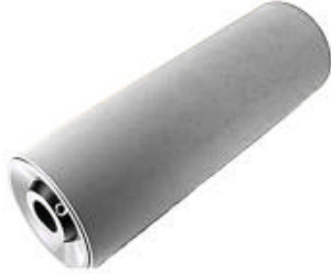
EE305545 Friction Roller Assembly ICBT & Verdol 450 with Full Length Cot