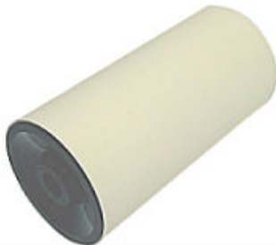
EE305547 Friction Roll with Cot Verdol 400 and 500