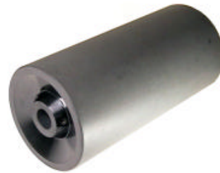
EE305547-1 Friction Roll without Cot Verdol 400 and 500