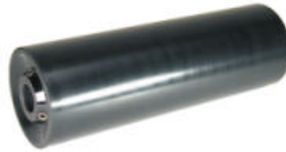
EE305545-1 Friction Roller Without Cot ICBT & Verdol 450