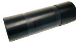
EE305548-1 Friction Roller Grooved Without Cot for Verdol 450