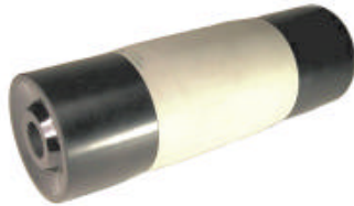
EE305548 Friction Roller Assembly Verdol 450 With Narrow Cot